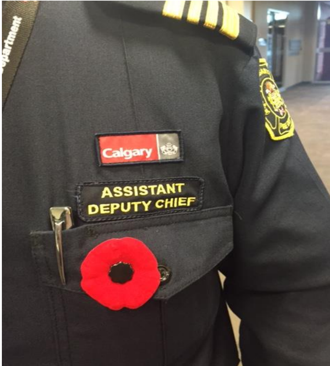
The City of Calgary logo 1/2" above the rank bar centered using Nomex thread